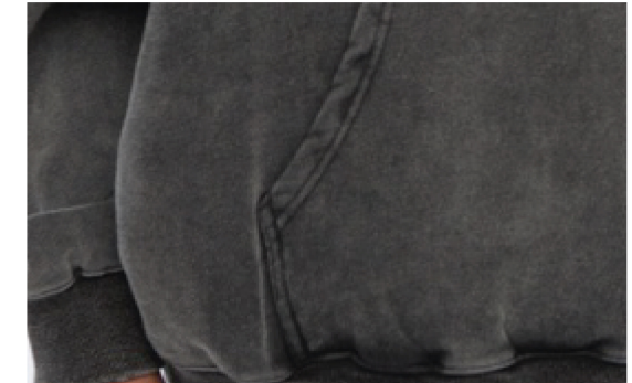
GARMENT ACID WASH REFERENCE